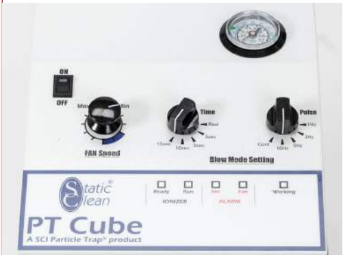
Controls for Power, Fan Speed, Blow Mode, Status Indicators & Pressure