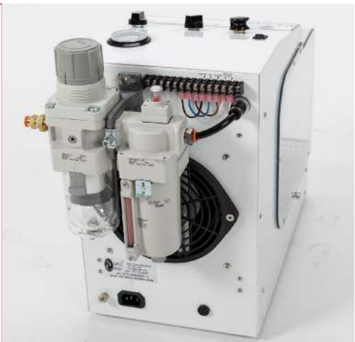
Dual-Stage Compressed Air Filtration 5-micron > 0.3-micron