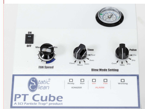
Controls for Power, Fan Speed, Blow Mode, Status Indicators & Pressure