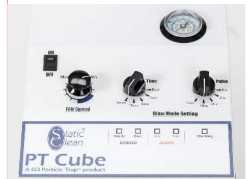
Controls for Power, Fan Speed, Blow Mode, Status Indicators & Pressure