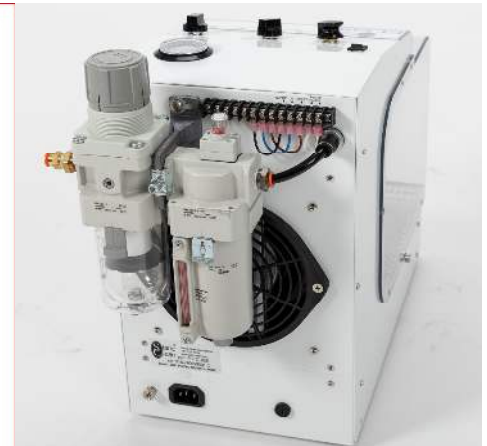
Dual-Stage Compressed Air Filtration 5-micron > 0.3-micron