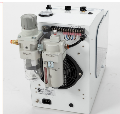
Dual-Stage Compressed Air Filtration 5-micron > 0.3-micron