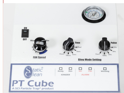
Controls for Power, Fan Speed, Blow Mode, Status Indicators & Pressure