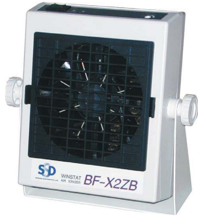
Static Elimination Area static elimination features