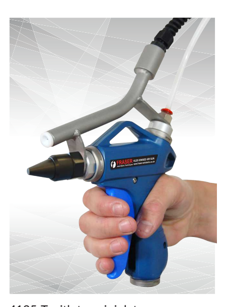
4125-T with top air inlet