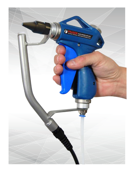
4125-B with bottom air inlet