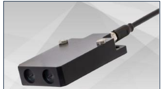
Static neutralization to meet the requirements of high-performance machinery at close range. Integrated Power Supply requires only a low voltage 24V DC input.

An ultra-compact 24 V DC Static Eliminator, ideal for installation in areas where space is at a minimum. Powerful, compact and easy to install.